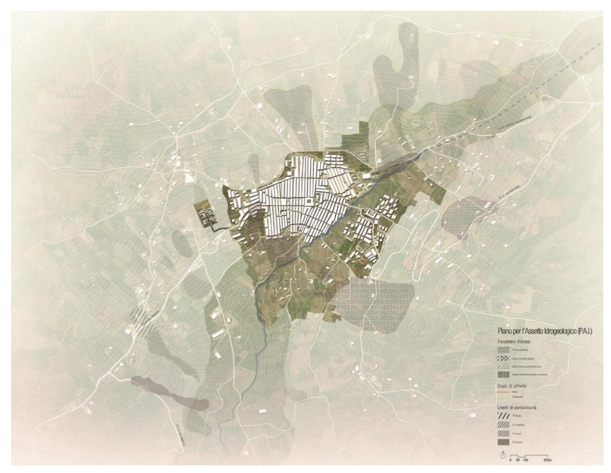
Fig. 4 | Redrawing the layout of Valledolmo in the Fiumara Valley territory © LabCity Architecture (DARCH-UNIPA), 2021