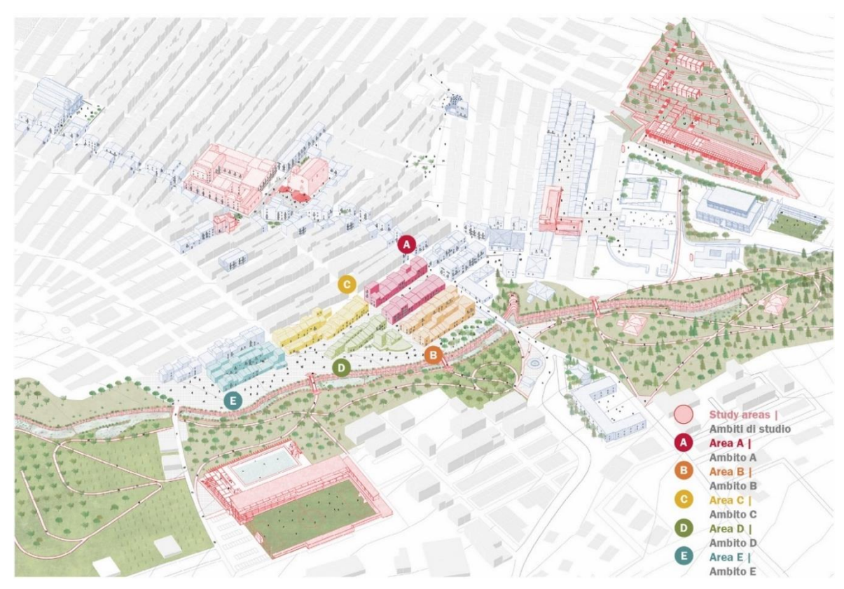
Fig. 5 | Redesign of the project areas of the Social Housing Community in the Roccafanara district in Valledolmo and the Parco della Salute in the Fiumara Valley © LabCity Architecture (DARCH-UNIPA), 2021