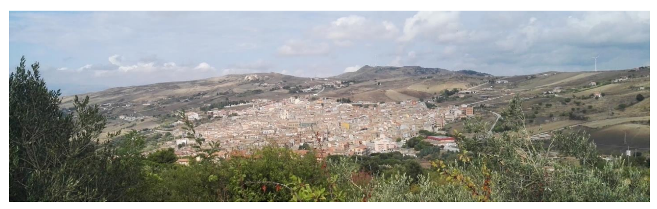
Fig. 3 | View of Valledolmo © LabCity Architecture (DARCH-UNIPA), 2021

The priority objective of the programme is to address to social, spatial and energy mixitè , the redevelopment of the Roccafanara district, with the reconfiguration of the existing blocks, many of them now in a state of disrepair, and with the redesigning of public space for pedestrian use.